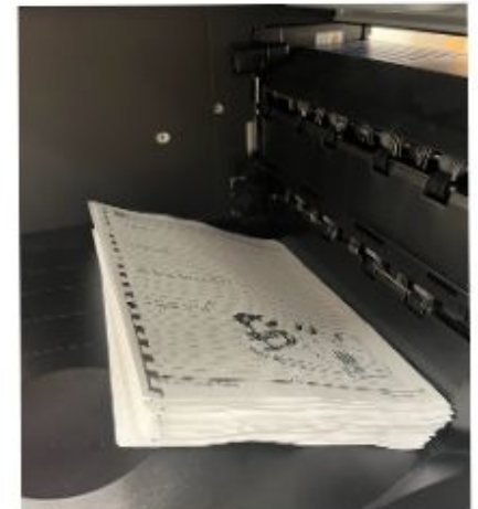
Copies found on a photocopy machine that were printed in excess.

More and more of the rainforest is being destroyed, but if we jump into action and conserve our paper, we will be able to save it.