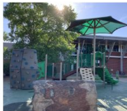
HGES Green Playground

This continues to be a debated topic, but for now, kids at Holly Grove will continue to have 25 minutes of recess daily.