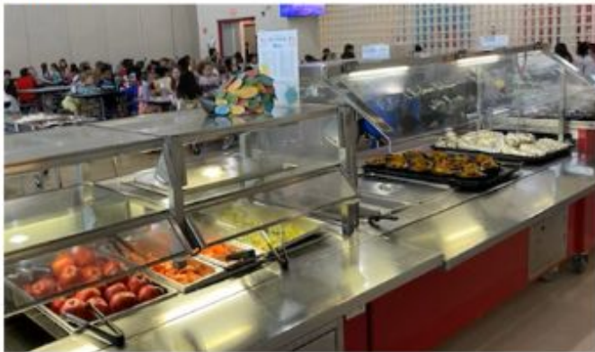
Cafeteria food line is ready for students to enjoy their lunch.

If you eat school lunch this article is for you! Ready to read all you need to know about school lunch? You will be left feeling great about your lunch. The lunch ladies are very pleased to make the food for all kids.